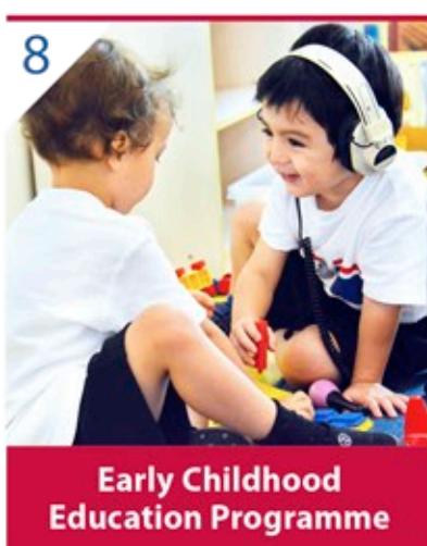
Early Childhood Education Programme

The young children in our Early Childhood Education (ECE) Programme experience the joy of learning through play in a warm and supportive environment, led and supported by our Kindergarten Co-Teachers.