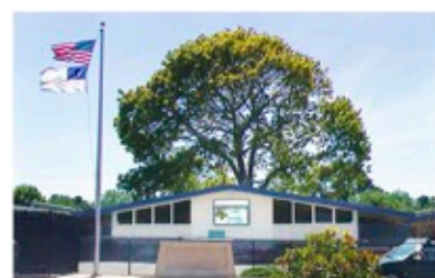
YCIS Silicon Valley