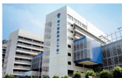
YCIS Hong Kong

These internal transfer applicants need to meet the eligibility requirements of the local government and may be re-assessed for admission and placement.